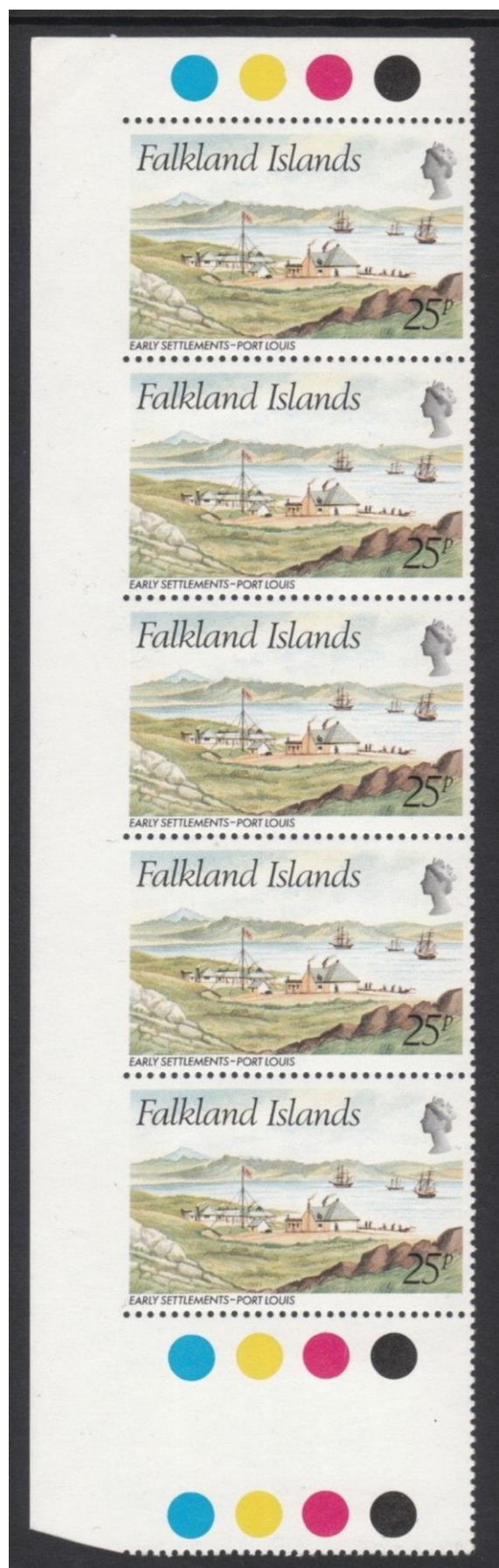
Figure 2 – The unique top pane of the imperforate Early Settlements 25p

Our last Under the Magnifying Glass mentioned ebay as a source of potential new flaws. This time we find highlight another ebay discovery; however a magnifying glass is not needed to see this variety!