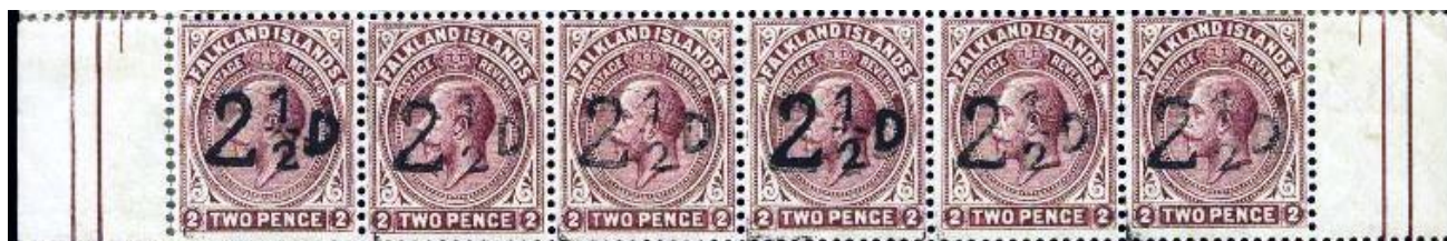
Figure 3 – A row of 1928 Surcharges