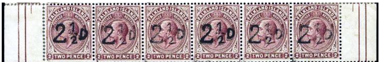
Figure 3 – A row of 1928 Surcharges